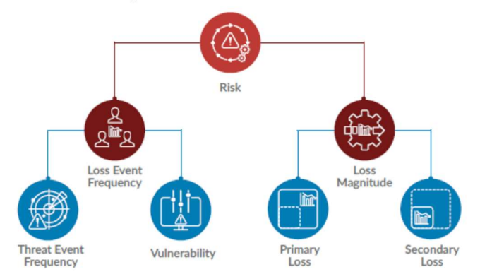
Figure 3: Factor Analysis of Information Risk (FAIR) Model

To measure cyber risk accurately, you need a new, more effective model for quantifying risk. The FAIR framework provides an open international standard risk model that was developed specifically to enable effective risk measurement. At its core, FAIR is a risk calculation model that overcomes issues of imprecision and lack of scope by specifically taking into account loss events, their likelihood, and their magnitude